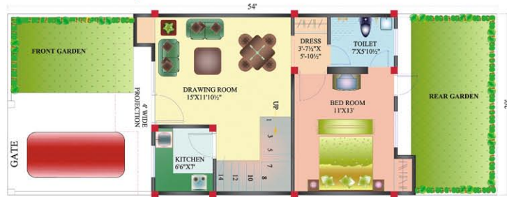
Apna Two Bedroom Unit