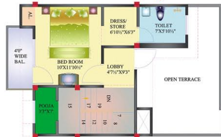
Ground Floor Plan ▼