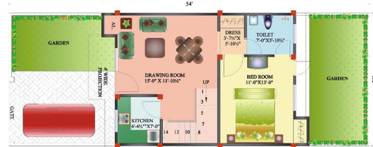
Apna Three Bedroom Unit